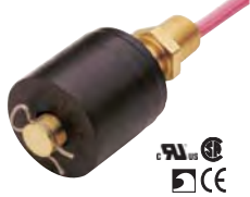
LS-1700 Series – Buna N Float