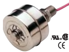
LS-1750 Series – All Stainless Steel