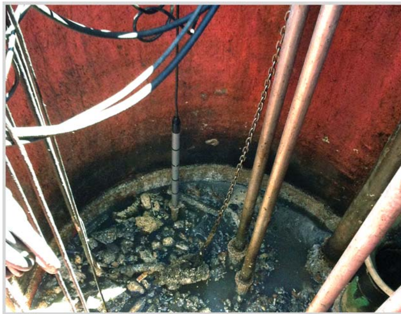
FOGRod hanging in wetwell