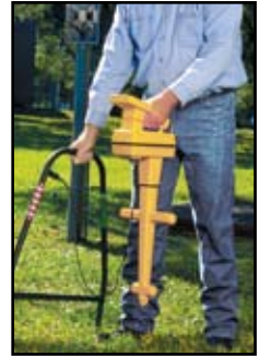
3M™ Dynatel™ Cable/Pipe and Fault Locator 2273M

The receiver also accommodates four user-definable auxiliary frequencies and allows the user to perform a self-calibration operation at any frequency at any time. With the easy-to-use configuration tool, users can enable or disable any of 22 frequencies.