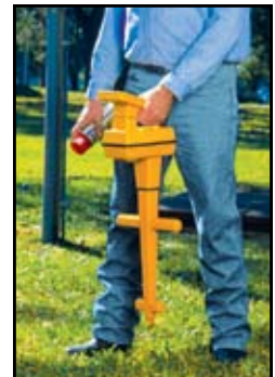
3M™ Dynatel™ Cable/Pipe Locator 2250M

* When connected to standard NMEA compliant GPS devices.