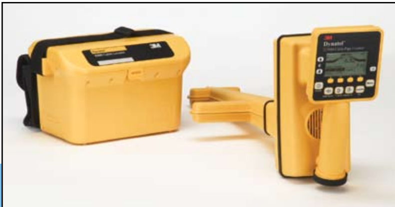
3M™ Dynatel™ Cable/Pipe Locator 2250M