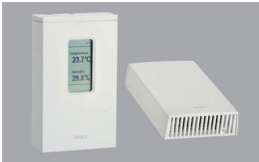
The HMW90 Series Humidity and Temperature Transmitters are designed for demanding HVAC applications.

The wall-mounted Vaisala HMW90 Series HUMICAP® Humidity and Temperature Transmitters measure relative humidity and temperature in indoor environments, where high accuracy, stability, and reliable operation are required.