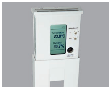
The sliding cover exposes offset trimmers and service port for calibration.

On-site calibration and adjustment is exceptionally easy. The sliding lid exposes offset trimmers for 1-point calibration of both humidity and temperature parameters. The included display makes adjustment clear and