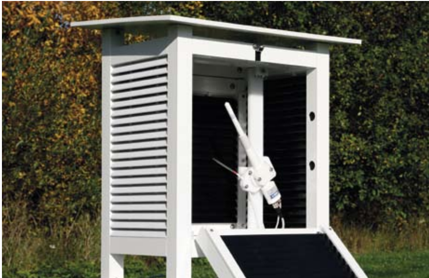
HMP155 with a new, stable HUMICAP®180R sensor and an additional temperature probe.